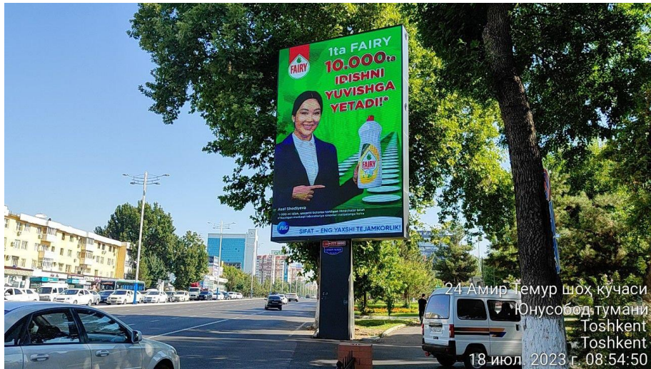
24-Амир Темур шоҳ кучаси Юнусобод тумани Toshkent Toshkent 18-июл. 2023 г. 08:54:50