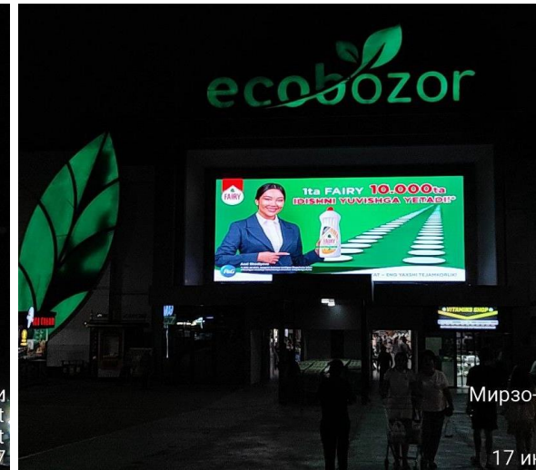
Мирзо 17-июл. 2023 г. 21:25:47