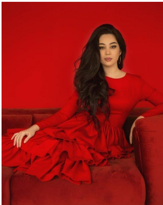
Collaboration with a popular local celebrity Asal Shodiyeva