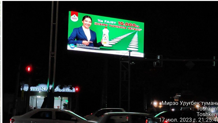
Мирзо Улуғбек тумани Toshkent Toshkent 17-июл. 2023 г. 21:25:47