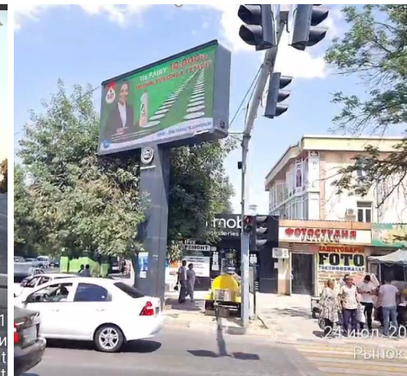
24-июл. 2023 г. 16:23:35 Рынок