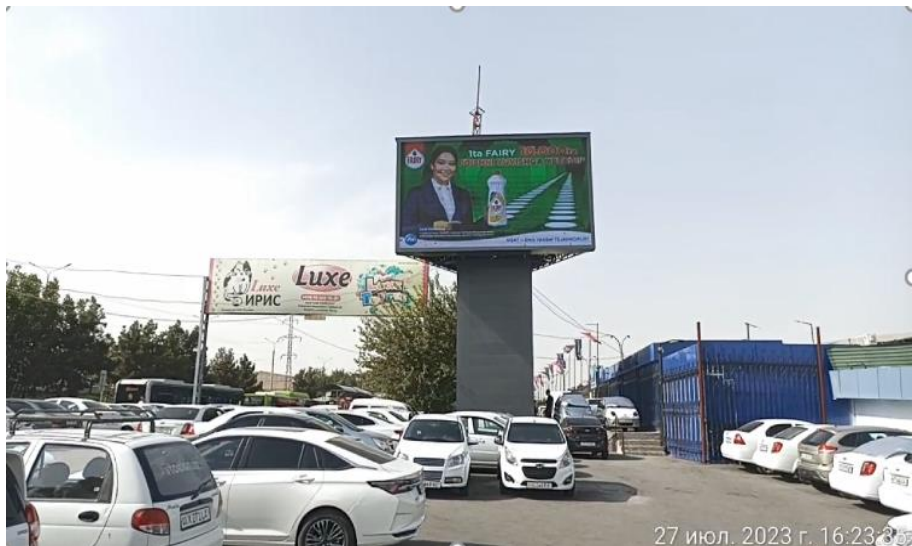
27-июл. 2023 г. 16:23:35